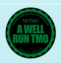
Dovecotes Kitemark Award