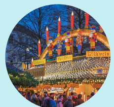
Dovecotes Christmas Trip