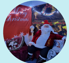
Santa is coming to Dovecotes