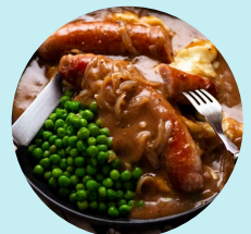
Friendship Fridays are Back